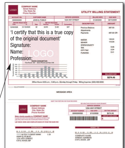
One document proving your current address

Important: Certification of photocopied documents must be done in the format as shown on these examples. Certification can be done on the front or back of each photocopied document. All certification signatures must be original signatures.