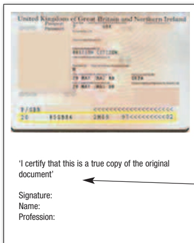
One document containing your photograph

For a list of acceptable documents and requirements, please refer to the application guidance notes.